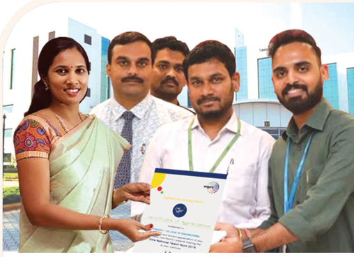
Felicitation by WIPRO for ALL INDIA'S TOP POSITION with More Placements