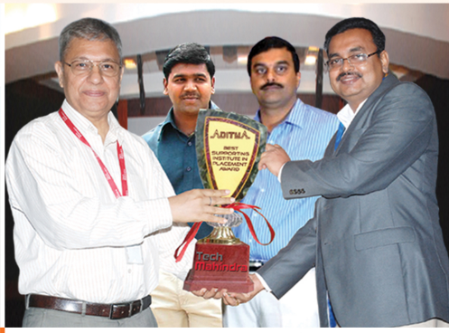
For achieving Max.No. of Placements OUTSTANDING PERFORMANCE AWARD from TECH MAHINDRA